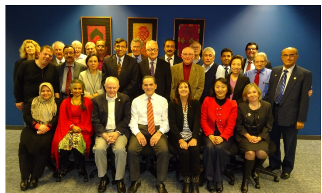
The IPA Executive, Standing Committee members & TAG Chairs during their meeting in March'15, in London, UK