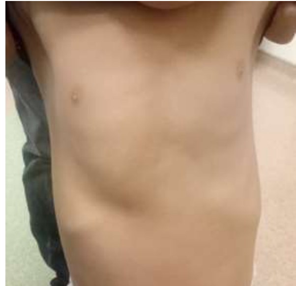
Figure 1. Chest depression at right lower anterior chest wall.

The mother gave the history of deformed chest since birth and was seen by many doctors especially when he had URTI. Since the child was asymptomatic, they were told not to worry about it and were informed that the deformed chest will correct itself. The deformed chest however became more prominent as he grew up. He has a good effort tolerance and able to play like any normal children. There was no clubbing of his fingers and he was not dysmorphic. On examination, there was a depression over the lower anterior chest wall, reduced chest expansion over the right lower chest with reduced note on percussion over the chest depression. His chest auscultation revealed a slightly reduced air entry on the right side